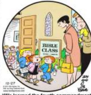
"We learned the fourth commandment: 'Honor thy father and thy mother.'"