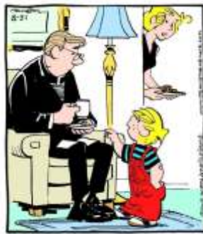
"SO, PASTOR, YOU WORK SUNDAYS AND THE OTHER SIX DAYS, YOU JUST HANG OUT?"