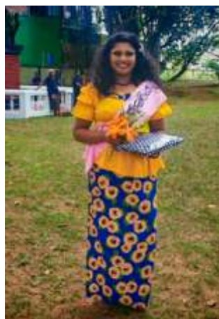
Ward 38 Team

The celebration was more than an event—it was a living testimony of compassion in action. We invite volunteers to join us on our monthly visits, continuing to spread love, fellowship, and hope to those who need it most.