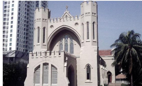
Saint Andrews Scots Kirk