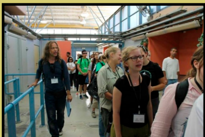
walking through the checkpoint