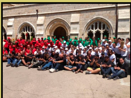
the Moving Mountains team representing the Palestinian flag